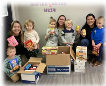
The Goddard School in Lake Orion (above) and Wally Edgar Chevrolet (below) organized food drives to benefit FISH.