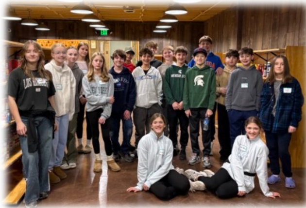
St. Joseph's FLOW (Confirmation) students cleaning, date checking, stocking and making expired food bags.