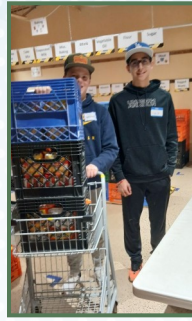
St. Joseph's FLOW group helping out in anyway needed as part of their monthly commitment to service.