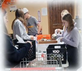
42 Strong came to the pantry to volunteer and give back to the community!