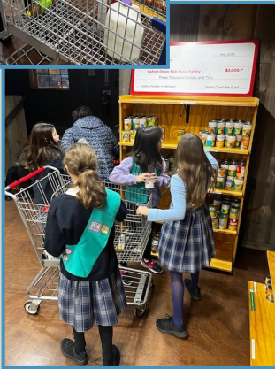
Girl Scout Troop 78314 volunteering their time at the pantry. Thanks, girls!