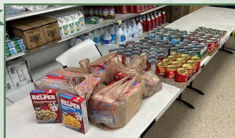
Anonymous donation to the food drive!