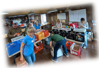
Sorting and date checking