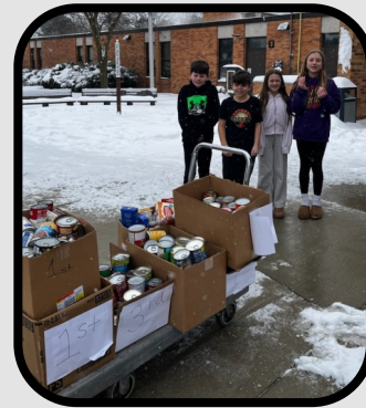
Clear Lake Elementary – organized a canned food drive