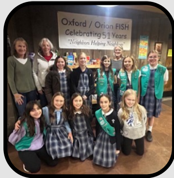
St Joseph Girl Scout Troop 78314 – sorted and stocked shelves