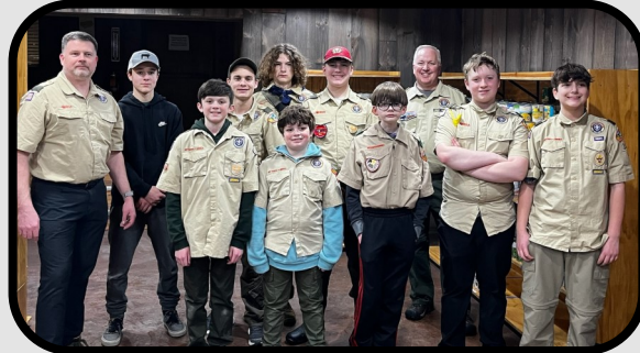
St Joseph Boy Scout Troop 186 donated, date checked, shelved supplies and broke down boxes