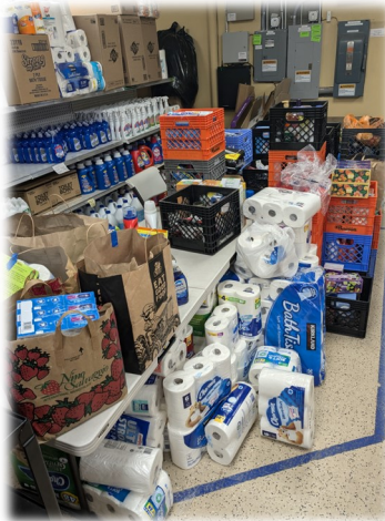
Christ The Redeemer Catholic Church – Annual St. Nicholas Day project